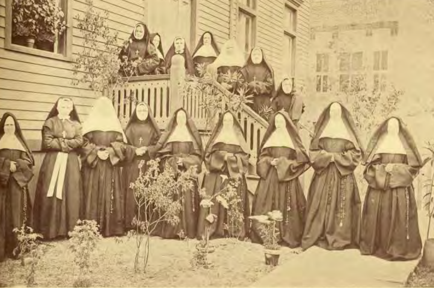
ABOVE—SISTERS OF HOTEL DIEU IN 1892.