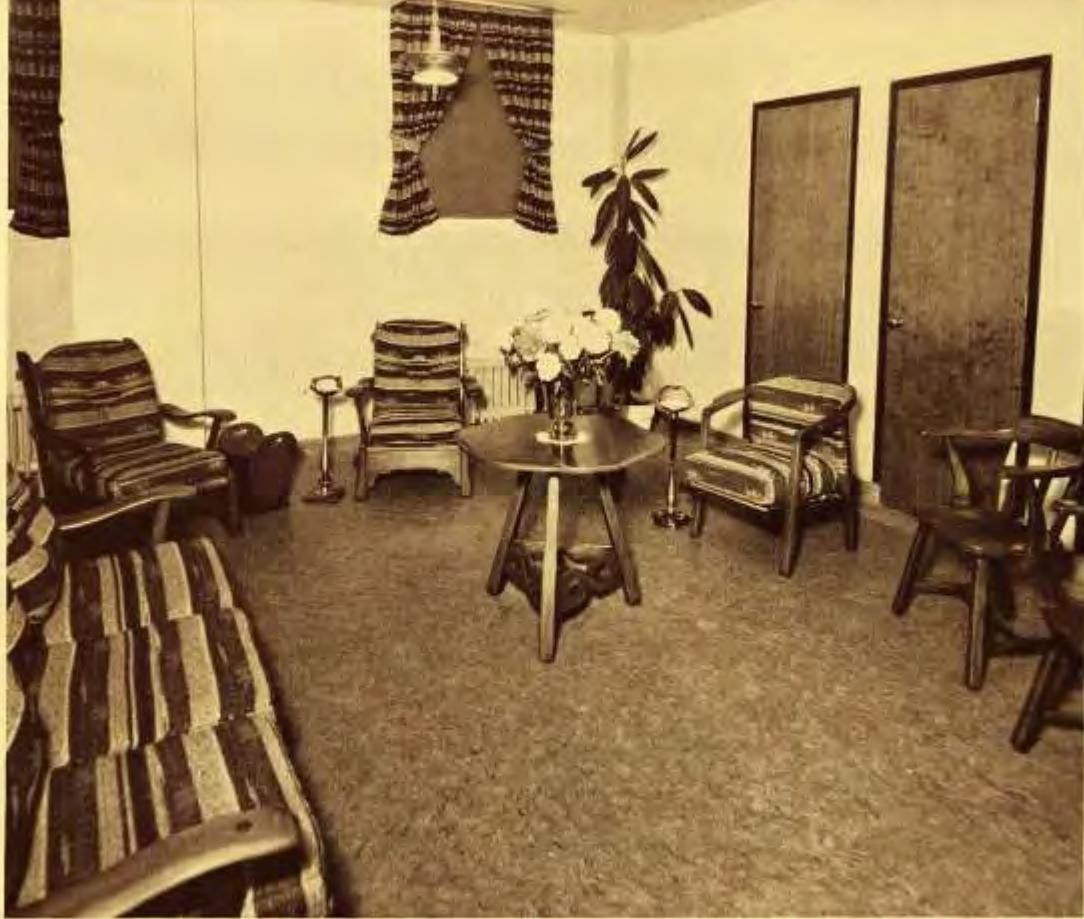
DOCTORS' WAITING ROOM