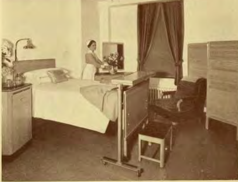
A PRIVATE ROOM