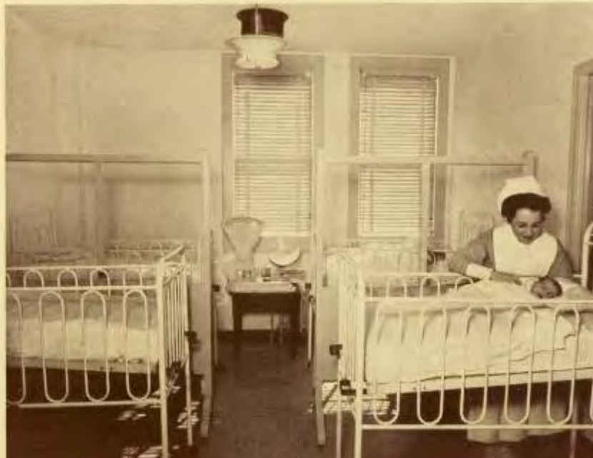
A COT ROOM

preliminary examinations safeguard against trans- mitting any contagion.