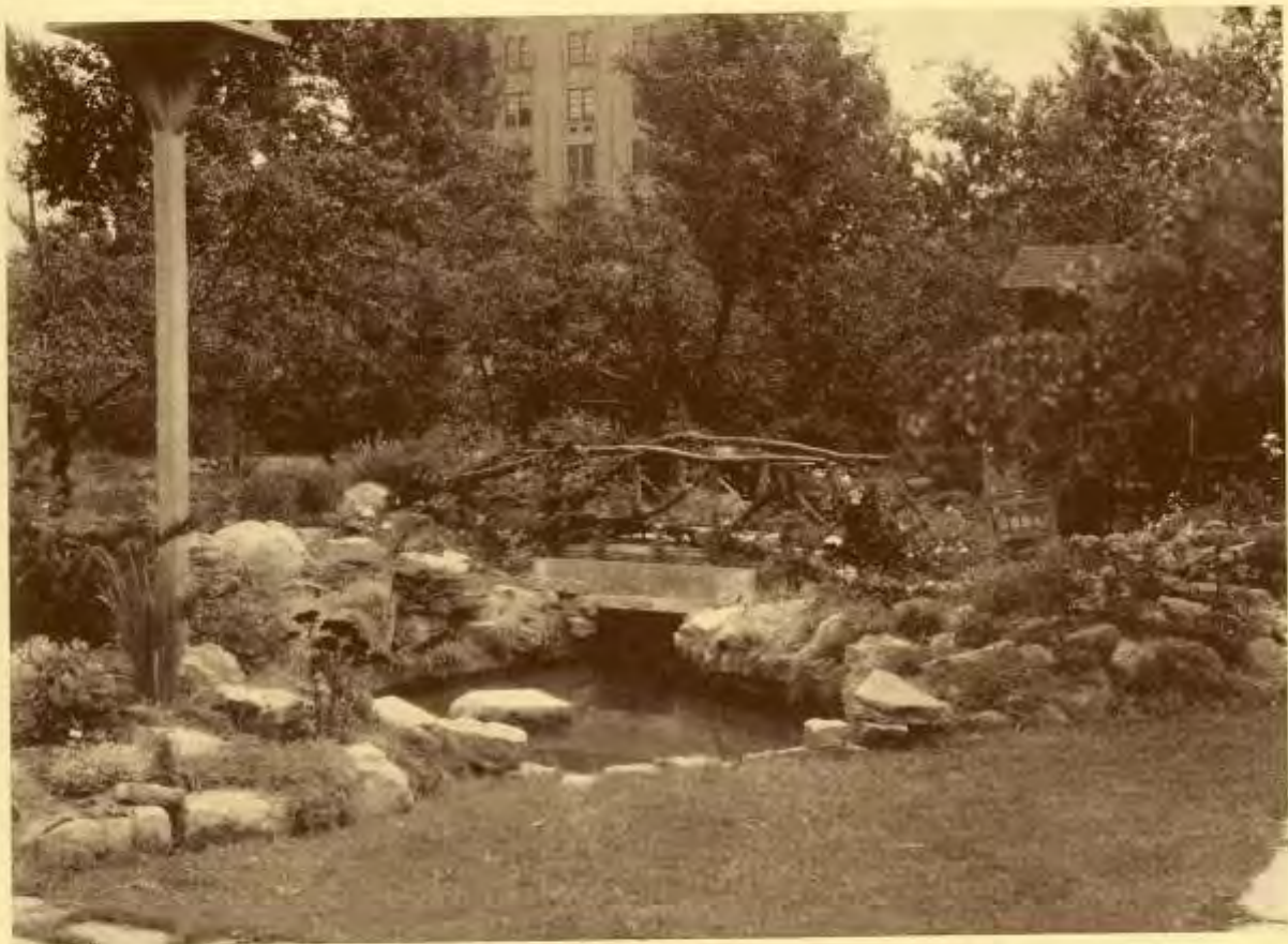
THE ROCK GARDEN

Here breath of roses fills the air, Here grassy green and tiny crags And rushes, lilies, waving flags Spell quiet peace remote from care.