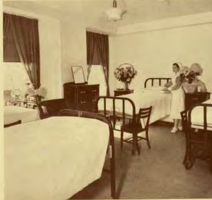
ONE OF THE WARDS