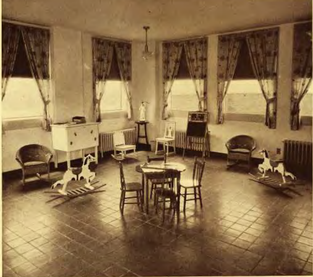
CHILDREN'S PLAY ROOM. Pleasant surroundings and interesting games maintain that happy mental attitude which is so important in convalescence of young patients.