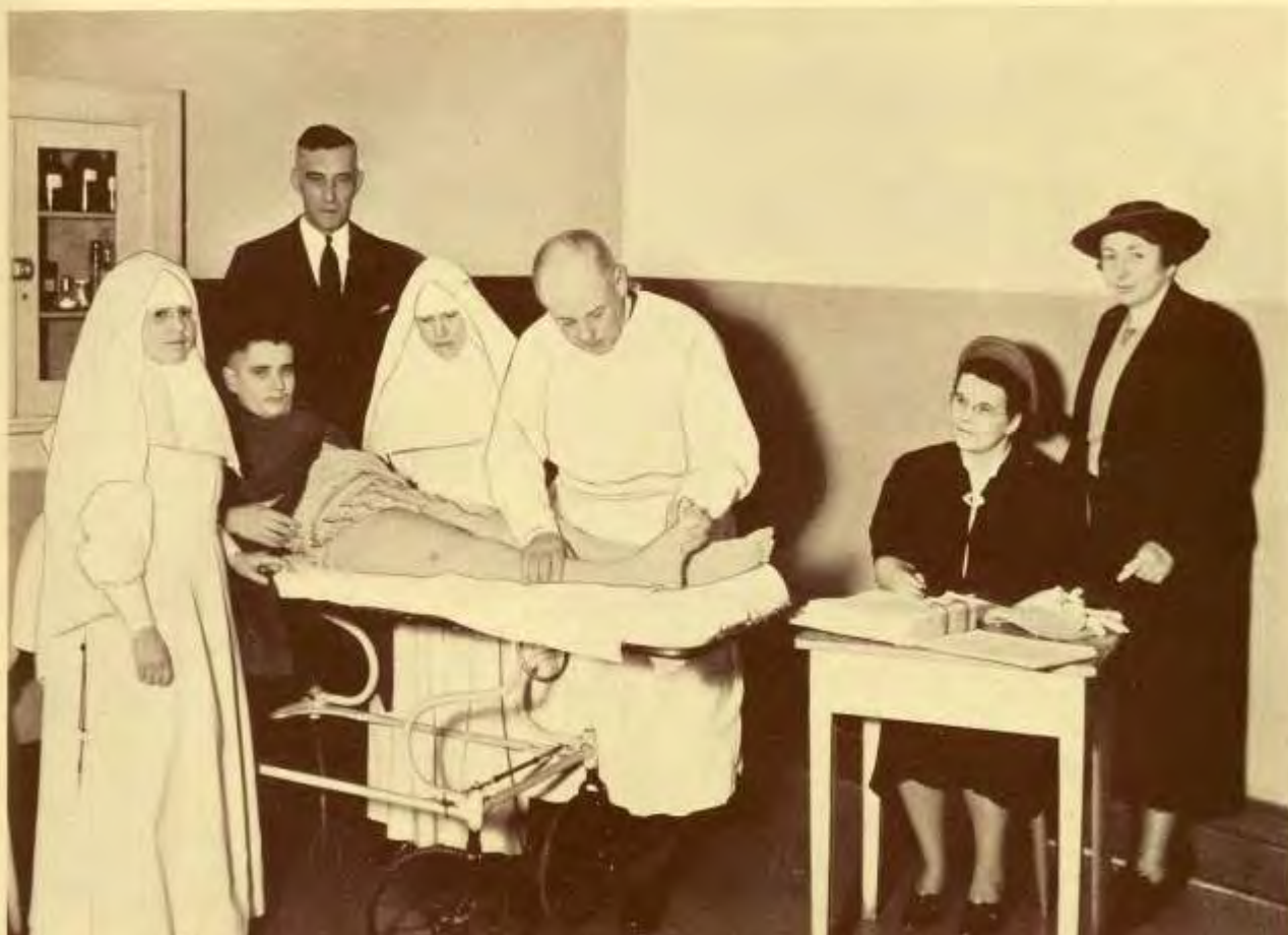
LIMB SAVERS. For 15 years the Windsor Rotary Club has been supporting the Orthopaedic Clinic, making it possible to give crippled children corrective operations aimed at restoring their limbs to normal.