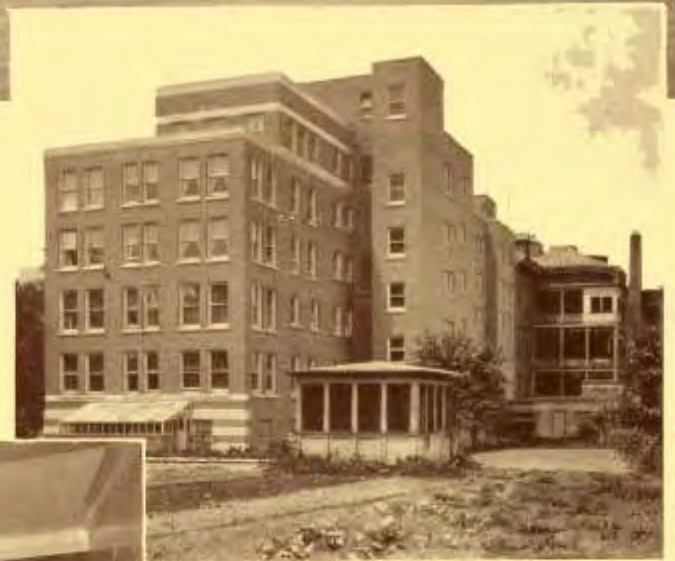
A view of the new building from the rock garden.