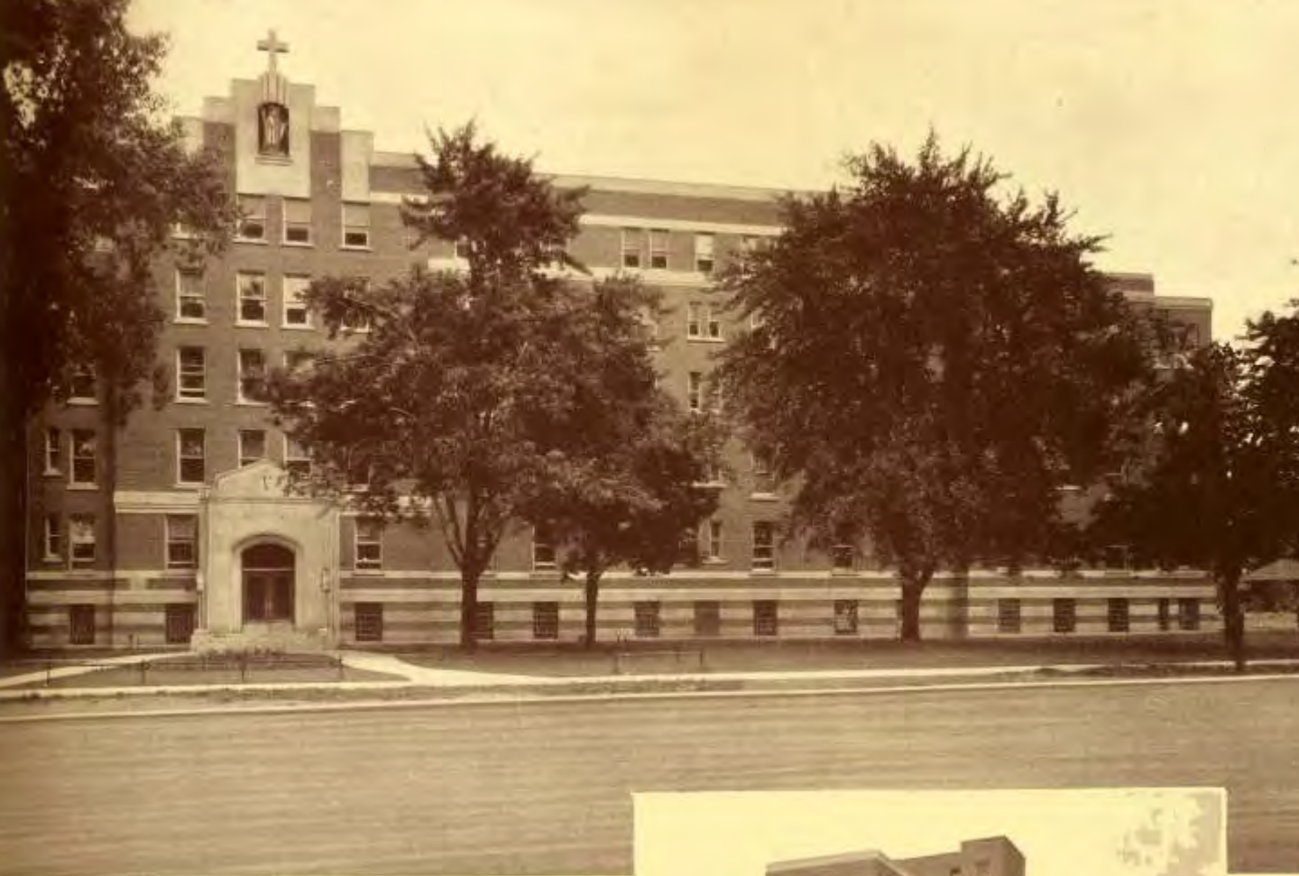
Looking at the new Hotel Dieu from Ouellette Avenue. A pleasing combination of red brick, sandstone and limestone makes it one of the city's most attractive buildings.