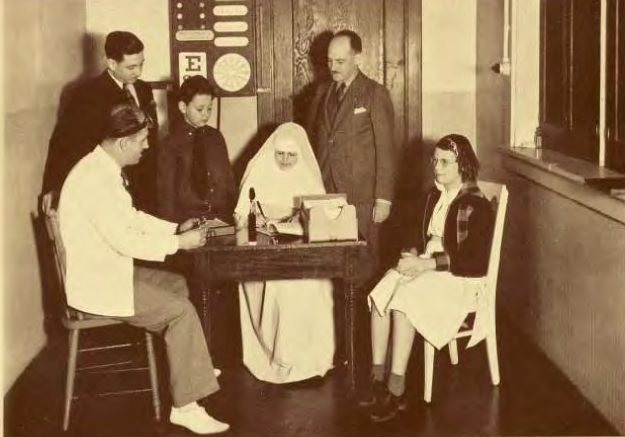
SIGHT SAVERS. Efforts of the Windsor Lions Club have prevented blindness and restored sight among hundreds of children in Windsor and the surrounding district during the period since 1929.