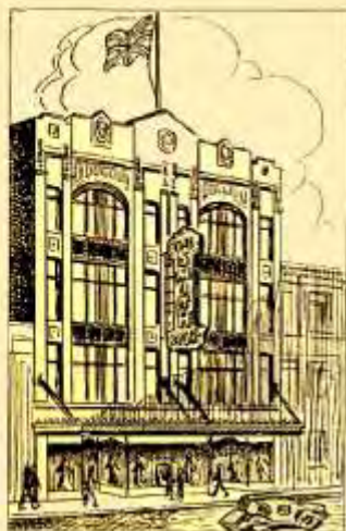
MAIN ENTRANCE - OUELLETTE AVE.

Professional Service Office: Dominion Square Bldg. Montreal, Que.