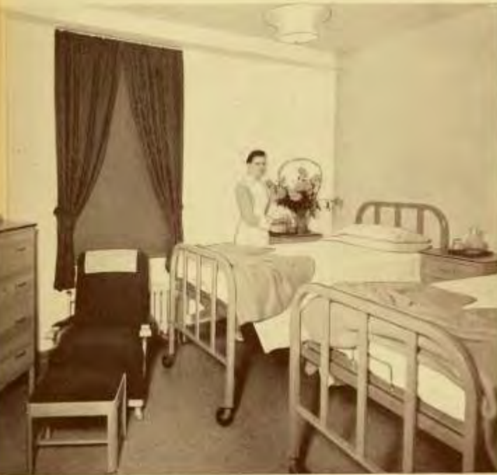
A SEMI-PRIVATE ROOM