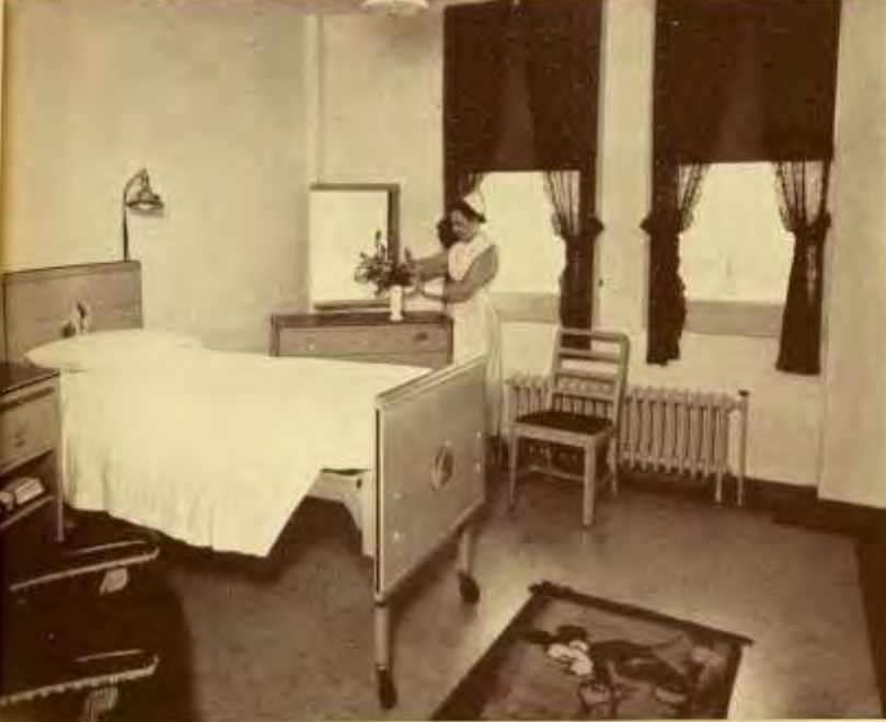
CHILD'S PRIVATE ROOM