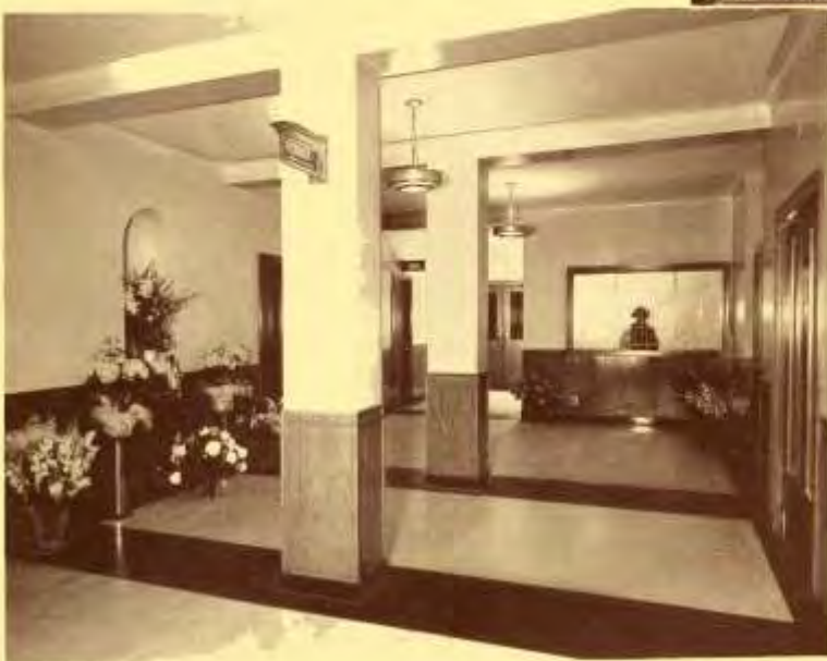
The spacious lobby, centre of the manifold activities throughout the five floors and basement.