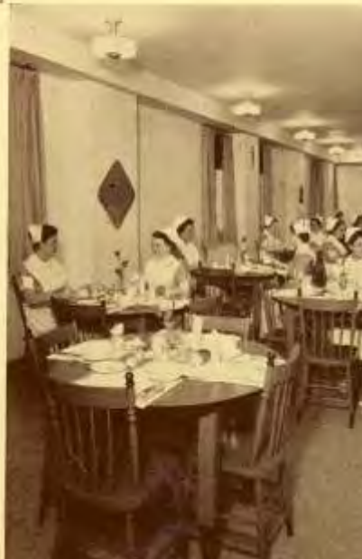
NURSES' DINING ROOM