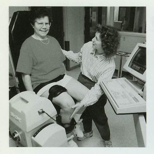
Rehabilitation Cost: $5.3 million

Rehabilitation is one of St. Joseph's new mandates. At the present time, too many patients are being forced to wait too long for rehabilitative care. Existing space will be redeveloped for the addition of 30 new shortand long-term rehabilitation beds, plus six regional respiratory beds.