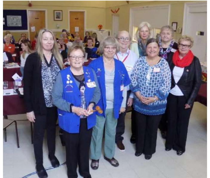
2017 AGM, The New Board of Directors