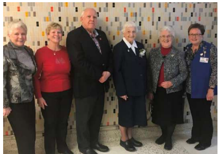
April 2018 Board Meeting