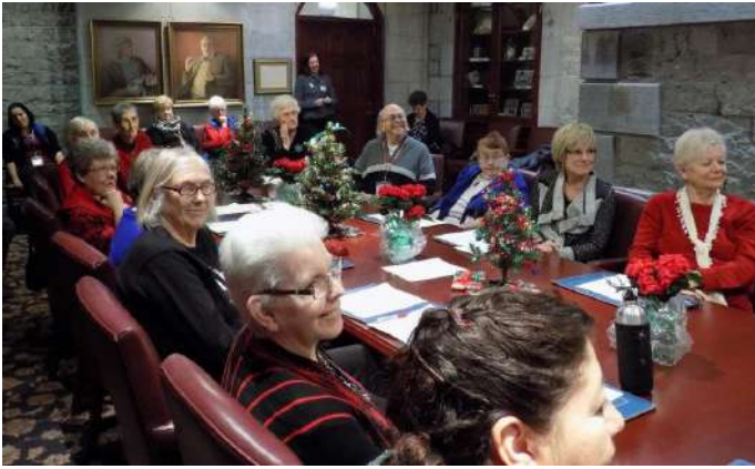
December 2016 Board Meeting