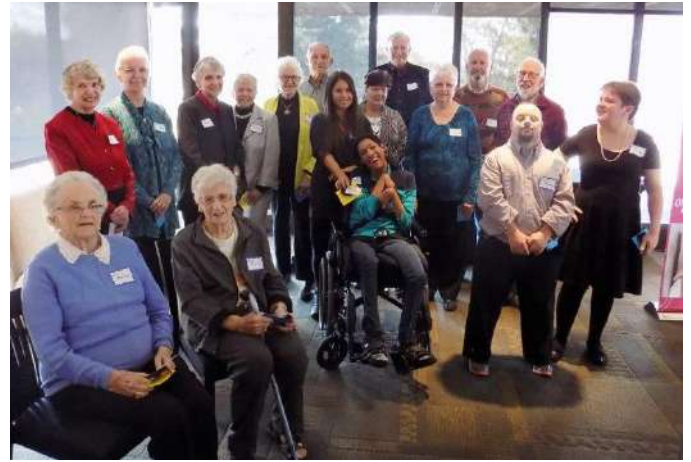
2015 Volunteers recognized for Years of Service