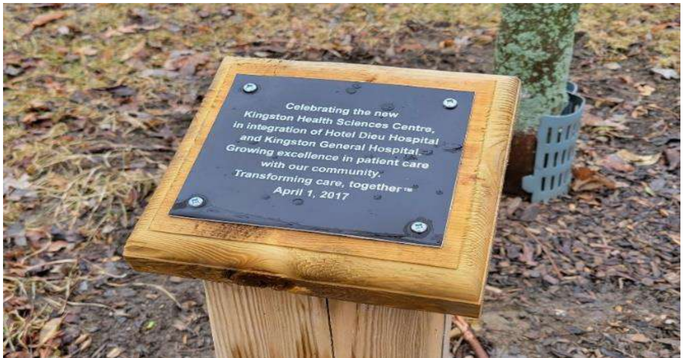
Tree Planting Ceremony and Plaque April 1 st , 2017