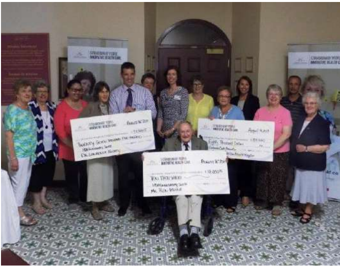
Celebrating donations made in 2017