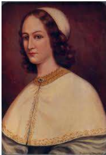
Venerable Jeanne Mance

The beauty and dedication of our amazing Volunteers.