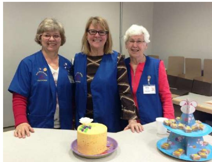
Easter Bake Sale 2015