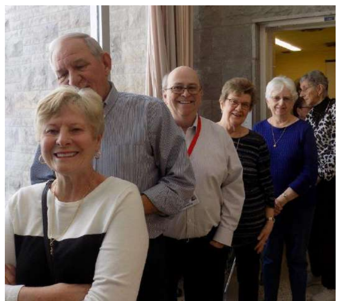
April 2018 Board Meeting