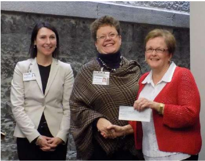
December 2015 Board Meeting donation to UHKF