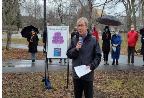
5 th Anniversary of the KHSC in 2022