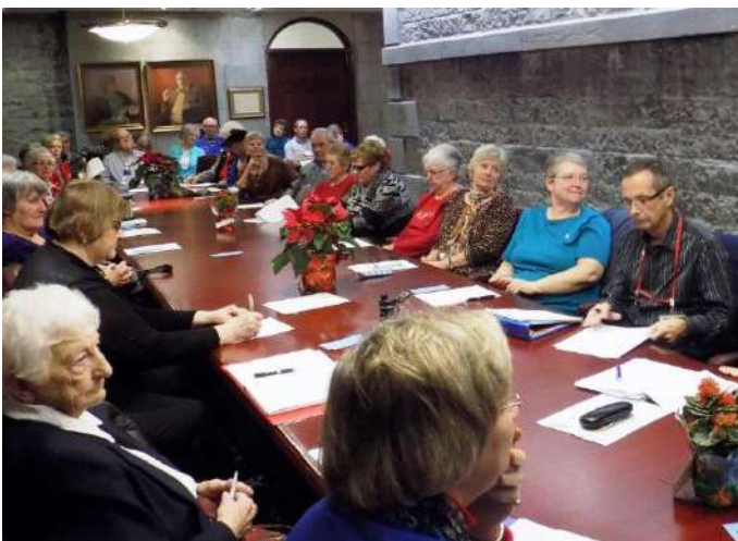
December 2015 Board Meeting