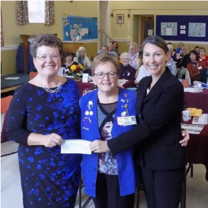
2017 AGM cheque presentation to UHKF