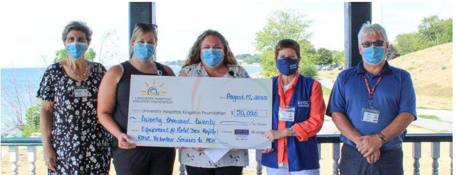
2022 donations of $53,914 and $20,020 to departments at Hotel Dieu Hospital