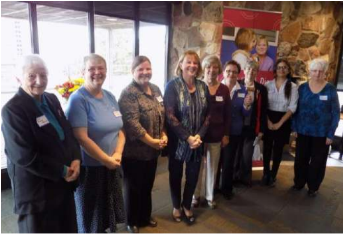
2015 AGM New Board of Directors