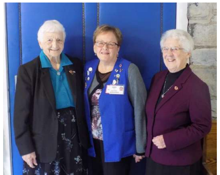
Local Life Member recipients with the President of Volunteer Services