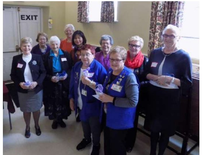
2017 Volunteers recognized for Years of Service