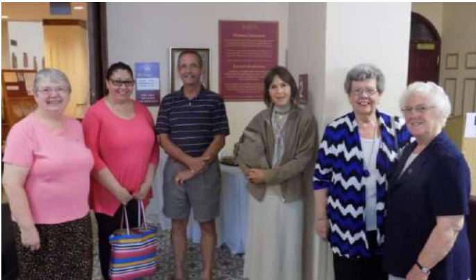
2017 Donation Announcement