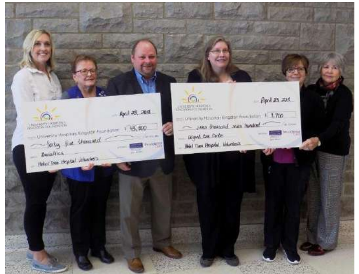
April 2018 Board Meeting donations